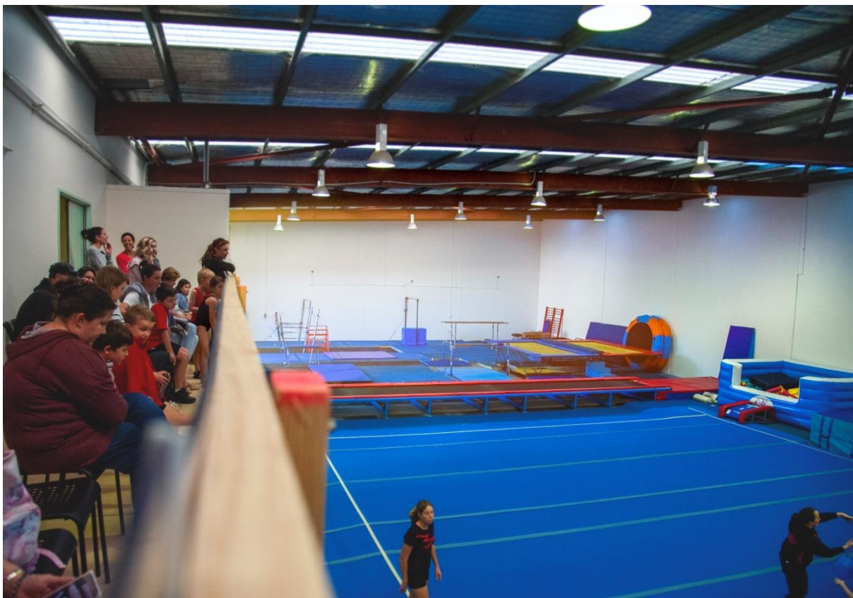
Viewing classes from the mezzanine!

Upstairs is our mezzanine viewing area, and from here you can see the whole gym! It is a great space for taking photos and videos of your kids too. Downstairs there is an additional viewing window.