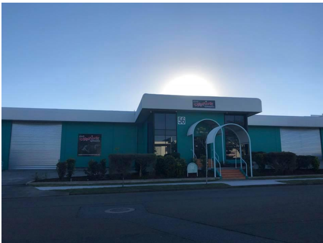
Club Dynamite – 56 Secam Street, Mansfield