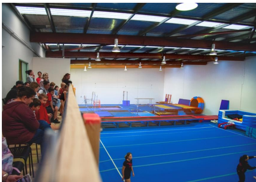
Viewing classes from the mezzanine!

Upstairs is our mezzanine viewing area, and from here you can see the whole gym! It is a great space for taking photos and videos of your kids too. This space has been closed temporarily due to the COVID restrictions, in such cases our 2 large roller doors are kept open so you can view safely from outside.