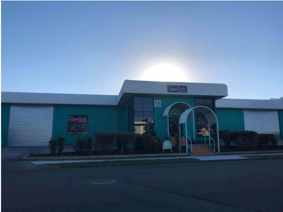
Club Dynamite – 56 Secam Street, Mansfield